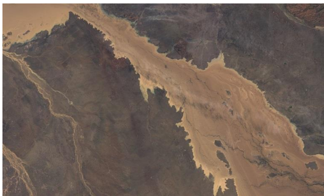
The 2019 flood in the Flinders River.

A first draft of the Isa Superbasin Stage 2 Baseline Synthesis report is close to completion and we will be giving you a first look at some of our results from the reports at our 6 August meeting. Keep an eye out for an email from us with a link to the report in late 2019.