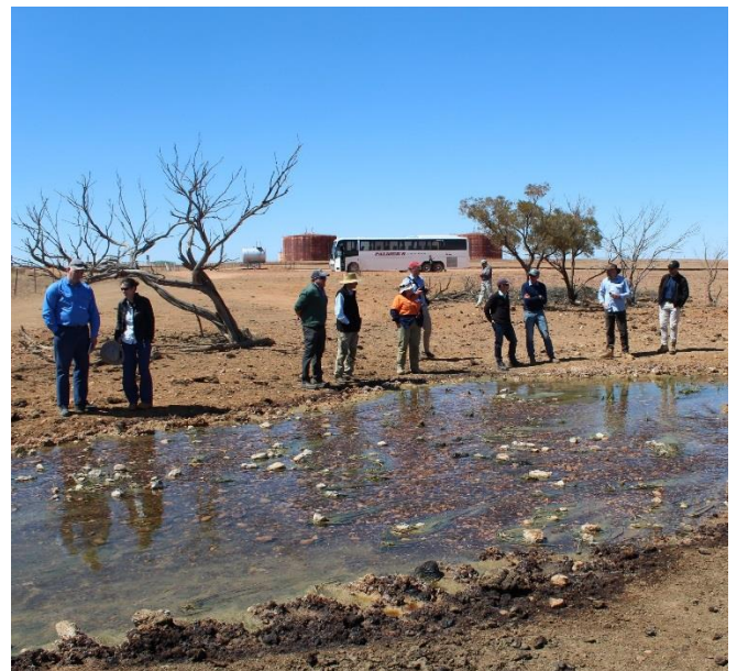
Stakeholders inspecting produced water at Jackson, Queensland.

We encourage you to share this newsletter more broadly within your communities and organisations, and in the future we will present further detail on the program's reports and address some frequently asked questions.