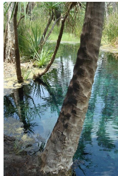
Mataranka Springs.

and any connections between the CLA and deeper aquifers. By collecting baseline information the program will be able to examine any potential impacts to the springs from future gas industry development in the Beetaloo Sub-basin.