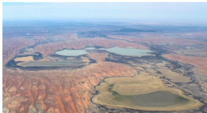
Coongie Lakes.

The Cooper Creek system is subject to a range of flooding events, which support life in the system. We are building a flood model to help analyse the potential impact that future development could have on the system. To do this we are building a high-resolution digital elevation model with aerial Light Detection And Ranging (LiDAR) data collection for Stage 3 hydrological modelling. LiDAR captures high resolution data (approximately 1m scale) on river and water course features: channels, rock bars, gorges, floodplains, banks and infrastructure.